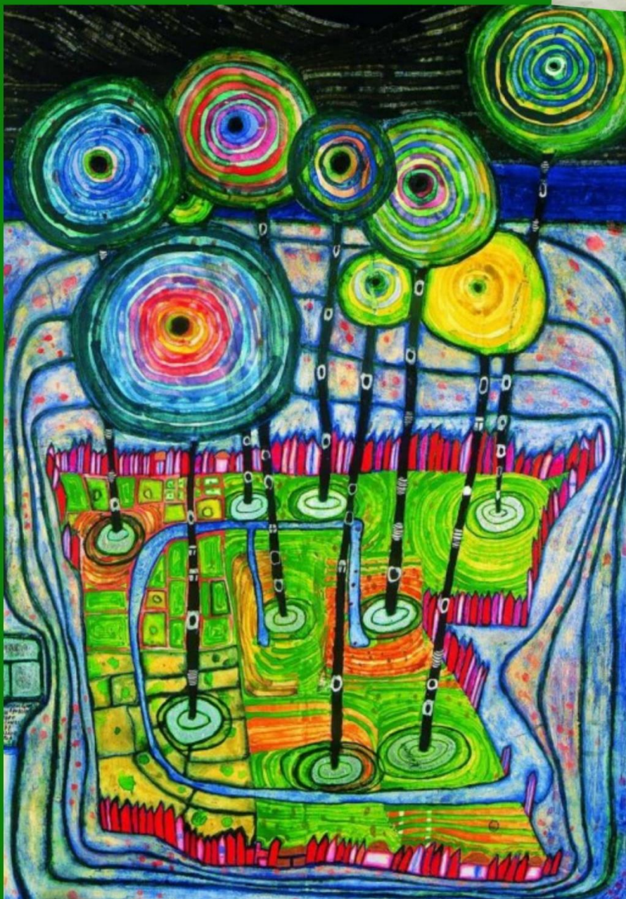
Jardin Public by Hundertwasser Watercolour, 1977

Hundertwasser painted pictures of places in towns and cities. This painting is a park near the Amazon River.