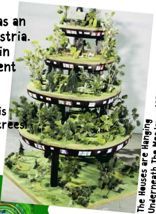
The Houses are Hanging Underneath The Meadows, 1972

Here is a model of one of his building designs. Look at all the trees!