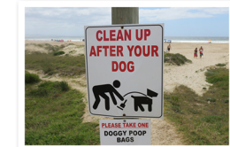
'Clean up after your dog' sign