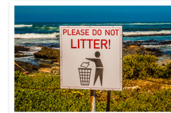
'No littering' sign

A community is made up of the people who live there. People in a community may have some similarities and differences but all people should be treated with kindness, compassion and respect. It is also important to look after the environment in a community. Removing litter and planting new bulbs are great ways to keep the community a nice place to live.