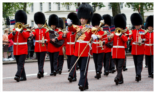
military marching band

A marching band is a group of musicians who perform their music while they are marching. They usually play brass, woodwind and percussion instruments. The musicians often wear a uniform and perform in parades or at special events. They usually march in lines and are led by a conductor. They work together to keep in time and follow the beat of the music.