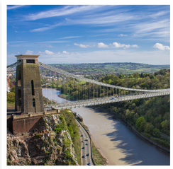
Clifton Suspension Bridge