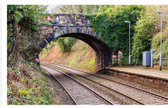
stone railway bridge