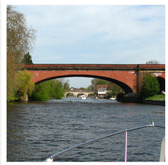
Maidenhead Railway Bridge